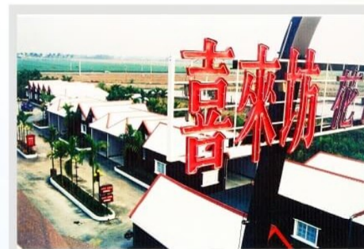
Shi-Lai square garden motel (Chao-Chou township Chie-Shou road in Ping-Dong) was built in January, 1992 and still operating with no remodeling.