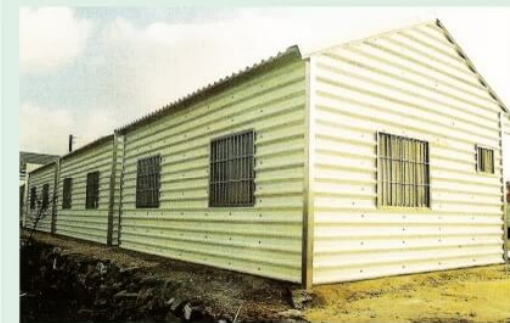
Vacation resort, Chi-Bei Island, Pong-Hu was built in December, 1998 and survived the 17-degree typhoon in June, 2001 with no damage.